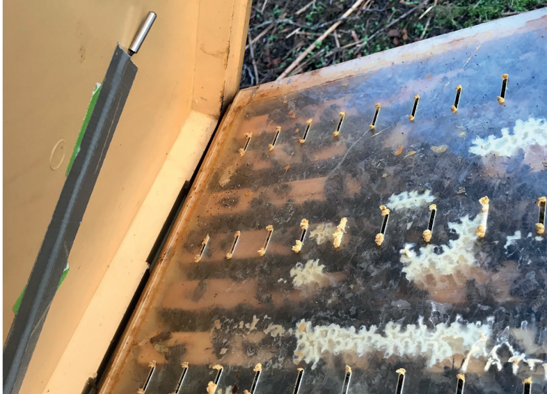
Location of the temperature probe inside the hive