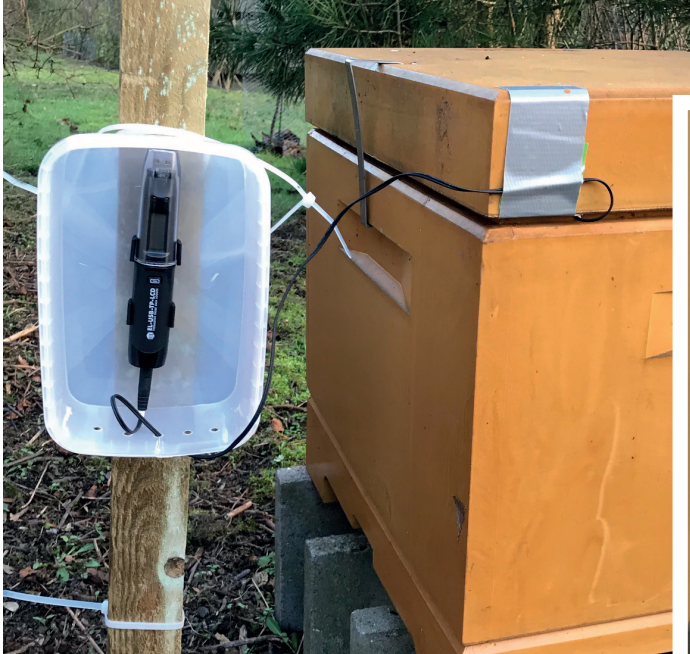
The logger positioned outside the hive

Joergen used the Lascar EL-USB-TP-LCD for the temperature monitoring. This is a USB temperature data logger that has a thermistor probe on a 1m cable. The logger was placed outside the hive, inside a plastic tub to give weather protection, and the probe placed inside the hive. Joergen found the logger