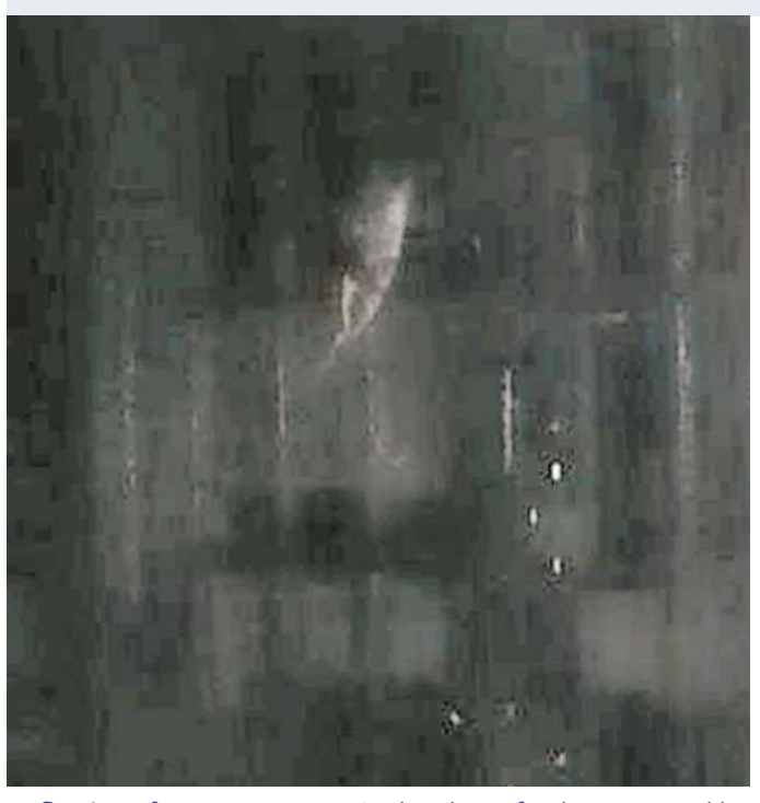
Reflection of a young woman in the glass of a doorcaptured by TSS cameras when no female investigators were present.

The benefit of Lascar Electronics' loggers is so great for TSS that Lance has contacted other paranormal investigation organizations about it. Lance concludes, "Personal experiences are not quantifiable and can even be caused by the investigator's own imagination. Our research is better matched with equipment that can log actual quantifiable data."