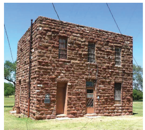
The Motley County Jail in Matador, Texas.